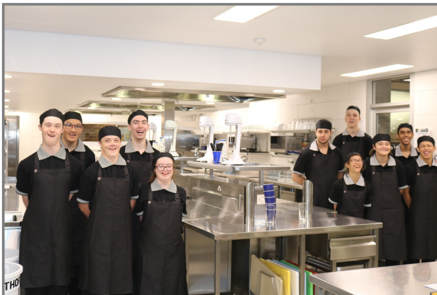
Year 11 Hospitality students wearing their new uniforms